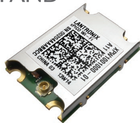
xPico Wi-Fi Actual Size

As one of the smallest embedded device servers in the world, xPico Wi-Fi can be utilized in designs typically intended for chip solutions, befitting in advantages to cost and time-to-market. Its "zero host load" eliminates any need for drivers on the connected microcontroller making implementation easy and fast with virtually no need to write a single line of code. This translates to considerably lower development costs and faster time-to-market. As xPico Wi-Fi meets FCC Class B, UL and EN EMC and safety compliance, your development time is shortened. xPico Wi-Fi can reduce the overall cost of ownership compared to the competition.