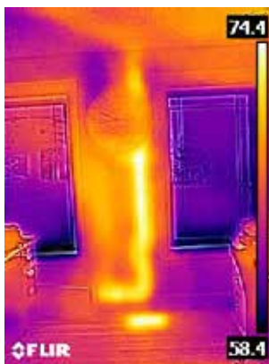
Warm drain pipe in wall