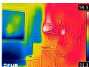
Uninsulated outside wall