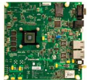
BSC9131 Reference Design Board

For more information about the QorIQ Qonverge BSC913x family, visit freescale.com/QorIQQonverge