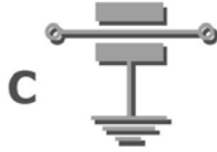
Dimensions mm (inches)