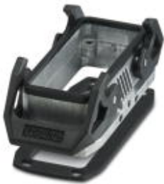
HEAVYCON B16 panel mounting base, with double locking latch, with flat gasket, salt-water-resistant aluminum, conductive profile gasket

Please be informed that the data shown in this PDF Document is generated from our Online Catalog. Please find the complete data in the user's documentation. Our General Terms of Use for Downloads are valid ( http://phoenixcontact.com/download )