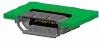
Off Set Mount