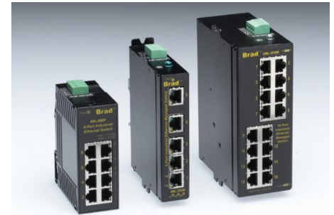
Direct-Link® Industrial Ethernet Switches

112036 Series 200 Unmanaged Switches Series 300 Managed Switches