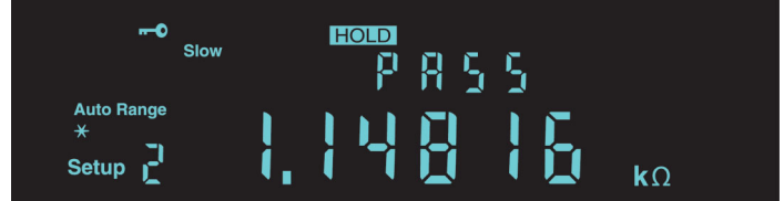
Limit compare mode on the DMM4020.

Dedicated front-panel buttons provide fast access to frequently used functions and parameters, reducing setup time. You no longer need to search through software menus to find the function you need.