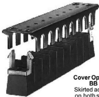
Cover Options BB Skirted access on both sides.