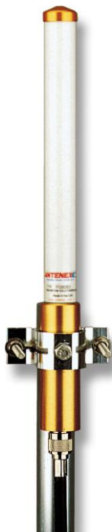
FG8240 (Shown with optional FM2SP mounting kit)