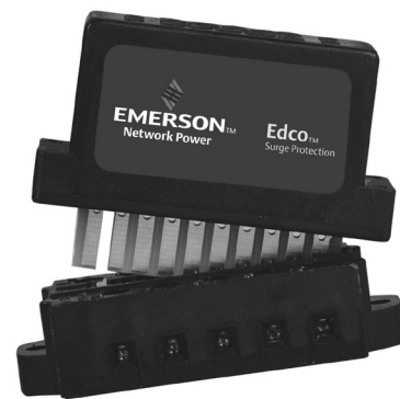
EDCO PCB1B-WKEY BASE SOLD SEPARATELY

Seulement le personnel qualifié doit installer ou maintenir ce système. Des précautions de sécurité en électricité doivent être suivies lors de l'installation ou de la maintenance de cet équipement. Pour éviter tout risque de choc électrique, débranchez et verrouillez toutes les sources d'alimentation de cet équipement avant de.