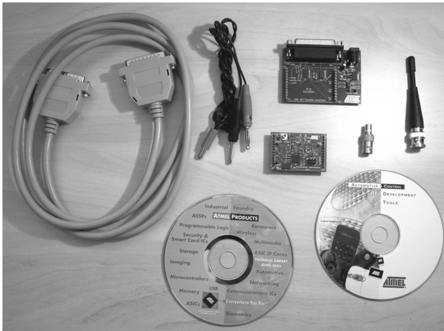
Figure 2-1. Kit Contents

The transceiver kit consists of a transceiver base station board, an SPI2LPT interface board, a DC supply cable, a parallel port cable, and a CD-ROM with the appropriate software, as depicted in Figure 2-1. The transceiver board and the SPI2LPT interface board have to be ordered separately.