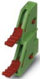
Ejectors, for assembly on each side of the header

Please be informed that the data shown in this PDF Document is generated from our Online Catalog. Please find the complete data in the user's documentation. Our General Terms of Use for Downloads are valid ( http://phoenixcontact.com/download )