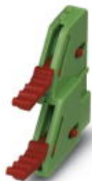
Ejectors, for assembly on each side of the header

Please be informed that the data shown in this PDF Document is generated from our Online Catalog. Please find the complete data in the user's documentation. Our General Terms of Use for Downloads are valid ( http://phoenixcontact.com/download )