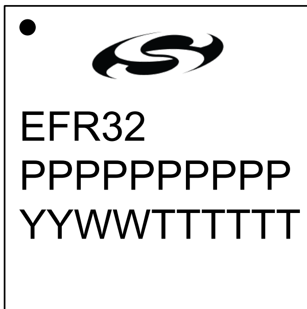
Figure 8.3. RQFN32 Package Marking