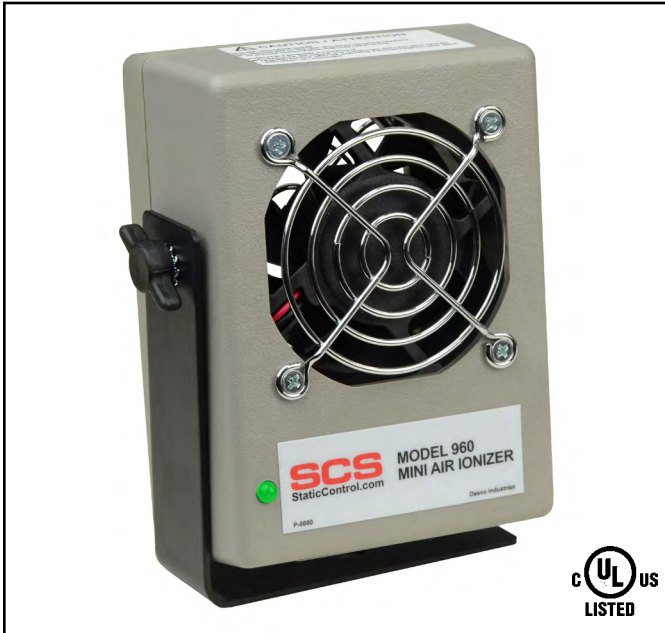
Figure 1. SCS 960 Mini Air Ionizer