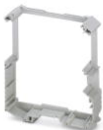
Complete housing, length: 99 mm, Central part, color: light gray, width: 22.5 mm

Please be informed that the data shown in this PDF Document is generated from our Online Catalog. Please find the complete data in the user's documentation. Our General Terms of Use for Downloads are valid ( http://phoenixcontact.com/download )