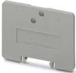
Partition plate, Length: 42.5 mm, Width: 2.5 mm, Height: 30.5 mm, Color: gray

Please be informed that the data shown in this PDF Document is generated from our Online Catalog. Please find the complete data in the user's documentation. Our General Terms of Use for Downloads are valid ( http://phoenixcontact.com/download )