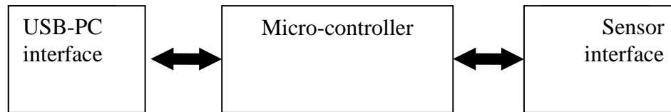
Figure 1: Block diagram of USB DEVEL KIT