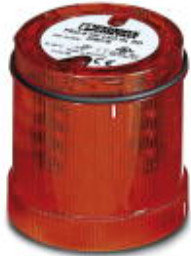
LED rotating light element, 24 V AC/DC, red

Please be informed that the data shown in this PDF Document is generated from our Online Catalog. Please find the complete data in the user's documentation. Our General Terms of Use for Downloads are valid ( http://phoenixcontact.com/download )