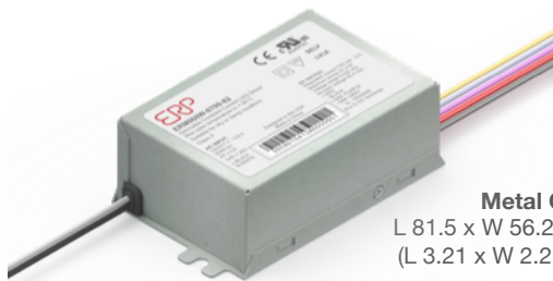
Metal Case L 81.5 x W 56.2 x H 31.5 mm (L 3.21 x W 2.21 x H 1.24 in)