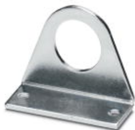
Fixing bracket for protective sleeves, fixed with two screws

Please be informed that the data shown in this PDF Document is generated from our Online Catalog. Please find the complete data in the user's documentation. Our General Terms of Use for Downloads are valid ( http://phoenixcontact.com/download )