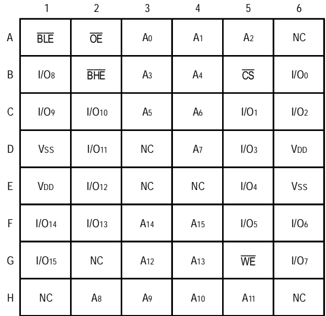
FBGA (BF48-1) Top View