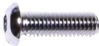
6mm Cap Screws x24