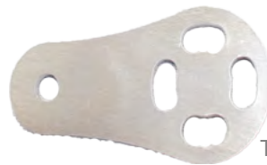
Terminal Bars x2