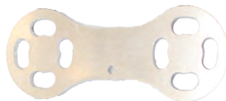
Bus Bar x6