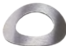
Spring Washer x24