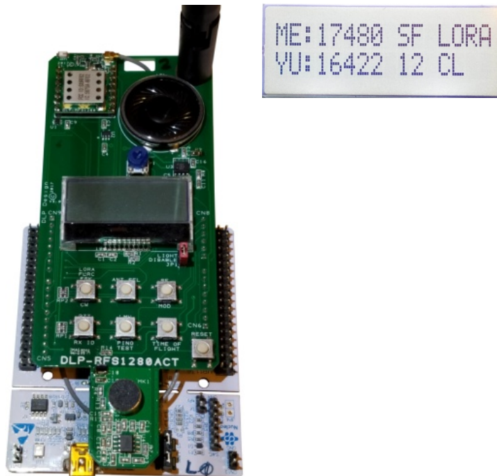
DLP-RFS1280ACT DEMONSTRATION PLATFORM (Serving as a Target for this demonstration)

The system is set up and ready for this demonstration once all Target transceivers are powered and set to LORA Mode. If a Target is set to GFSK or FLRC Mode, simply press Button 1 until “LORA” is shown in the display: