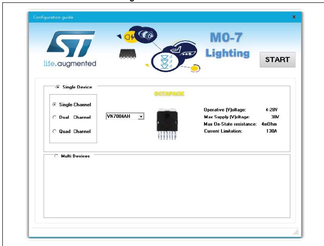
Figure 2. Gui interface

GUI is available to control the entire system, that is to say SPC560B-DIS Discovery board connected with the VIP-M07-ADIS application board. For more information, and download of the latest version available, please refer to ST web www.st.com .