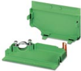
Cable housing, Pitch: 0 mm, Number of positions: 24, Dimension a: 120 mm, Color: green

Please be informed that the data shown in this PDF Document is generated from our Online Catalog. Please find the complete data in the user's documentation. Our General Terms of Use for Downloads are valid ( http://phoenixcontact.com/download )