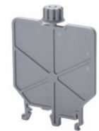
Mounting Accessories for CTSPC