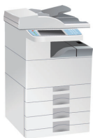
Office Automation Equipment (Copier, Printer)