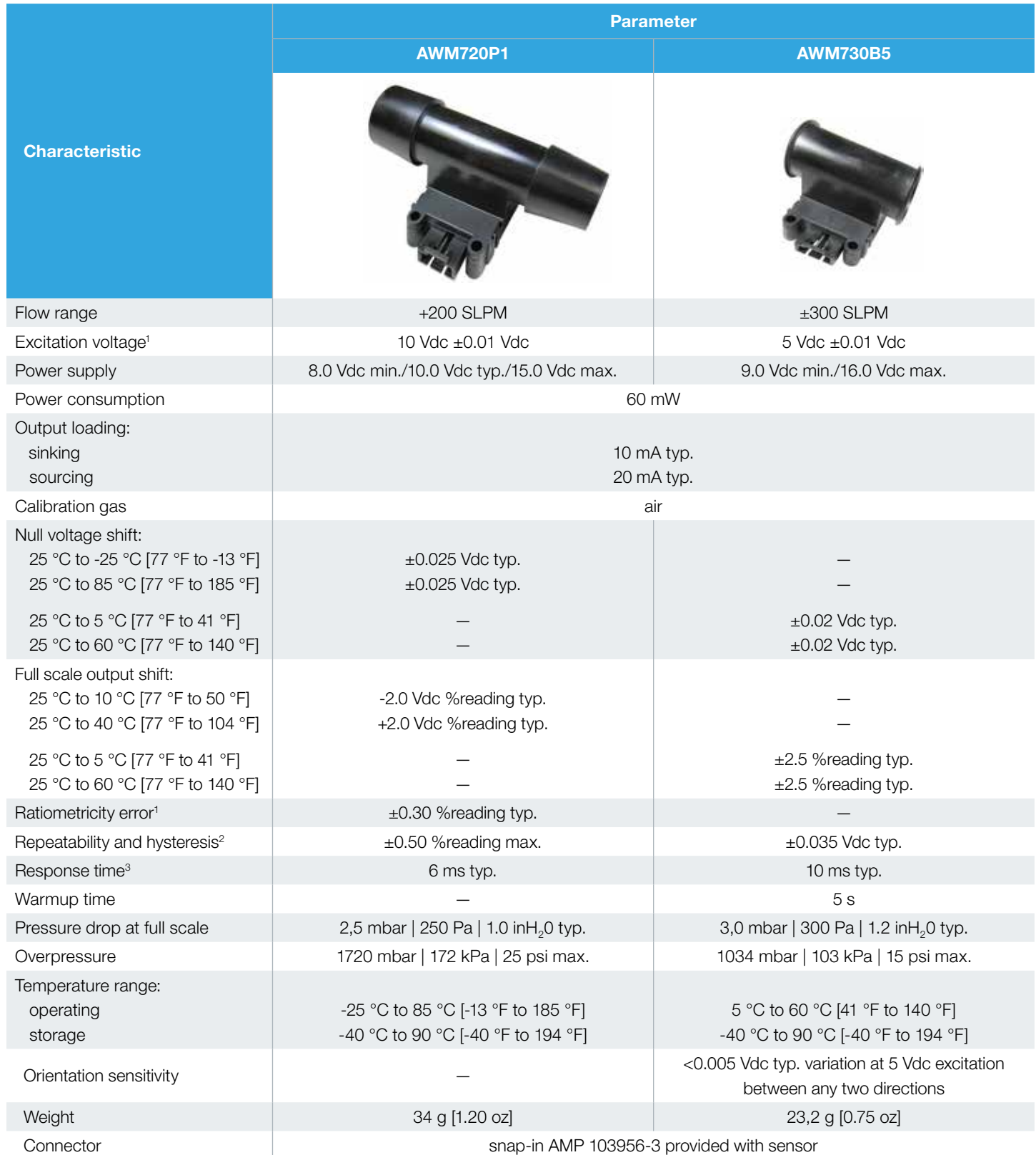
Table 1. Specifications