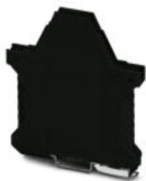
Component housing, length: 99 mm, Lower part, color: black, width: 12.5 mm, height: 114.5 mm

Please be informed that the data shown in this PDF Document is generated from our Online Catalog. Please find the complete data in the user's documentation. Our General Terms of Use for Downloads are valid ( http://phoenixcontact.com/download )