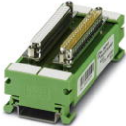
VARIOFACE termination board, with a 37-pos. D-SUB socket strip to a 37-pos. D-SUB pin strip, 1:1 connection

Please be informed that the data shown in this PDF Document is generated from our Online Catalog. Please find the complete data in the user's documentation. Our General Terms of Use for Downloads are valid ( http://phoenixcontact.com/download )