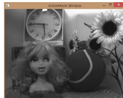
Camera Tool view mode