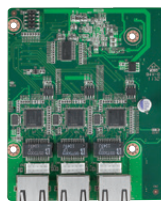
MI0e-220 3 x Intel® Gigabit Ethernet