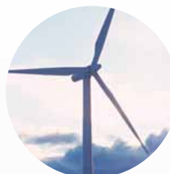
Wind power generation