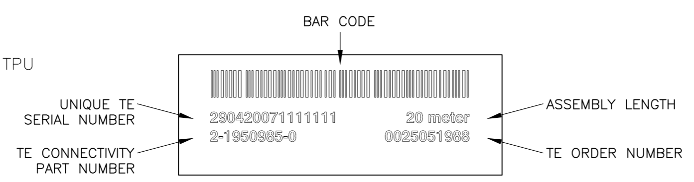
LABEL DETAIL: 3