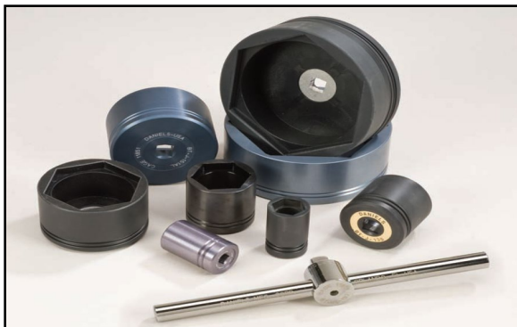
DMC1358 COMPOSITE JAM NUT TOOL KIT

The correct application of torque is essential to most connector applications where Jam Nut receptacle connectors are used. The sealing components (usually an "O" ring) must be compressed, but not to the point of damage. Another important consideration when tightening Jam Nuts is the thread strength, especially in the various types of aluminum and composite connectors.