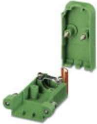
Cable housing, Pitch: 0 mm, Number of positions: 5, Dimension a: 39.9 mm, Color: green

Please be informed that the data shown in this PDF Document is generated from our Online Catalog. Please find the complete data in the user's documentation. Our General Terms of Use for Downloads are valid ( http://phoenixcontact.com/download )