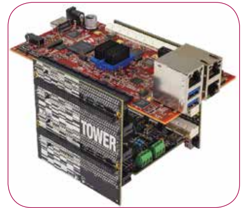
Figure 1. TWR-LS1021A module (TWR-LS1021A, TWR-SER-IO and TWR-ELEV)