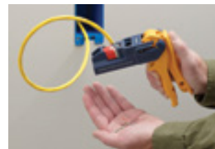
6. Wires will be seated and cut for a solid termination.