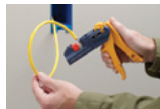
3. Insert jack in JackRapid front first with IDC slots facing blades of JackRapid.