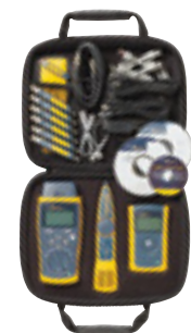
CableIQ Gigabit Service Kit