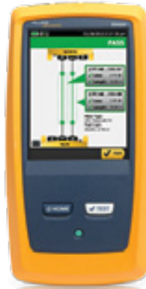
More on page 21