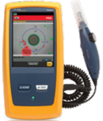
More on page 28