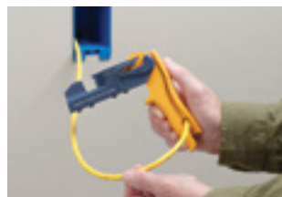
1. Strip cable jacket with a standard cable stripper or the built-in cable stripper.

Get accurate terminations and clean, consistent cuts every time with the JackRapid Termination Tool.