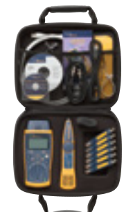
CableIQ Advanced IT Kit

CableIQ Gigabit Service Kit combines powerful Gigabit cable and network testing. Expedites problem resolution and facilitates moves, adds, changes, and upgrades. Documents cabling bandwidth and network link speed.