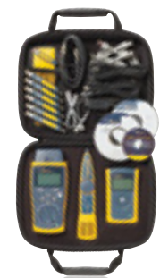
CableIQ Gigabit Service Kit