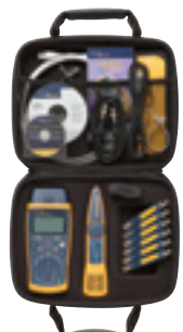
CableIQ Advanced IT Kit

To learn more visit: www.flukenetworks.com/cableiq