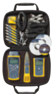
CableIQ Gigabit Service Kit