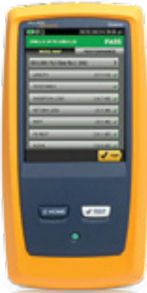
More on page 5

Faster systems acceptance for all copper and fiber certification jobs.