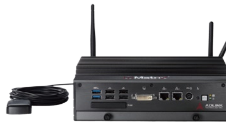
MXE-5300 with Antenna