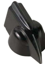
5600E, 5601E, 5602E