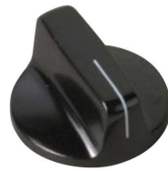
5500E, 5520E, 5521E