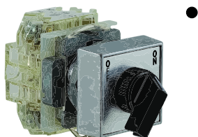
Selector switch 9001KXSA139 See page 71