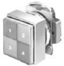
110–120 V, 50–60 Hz Transformer