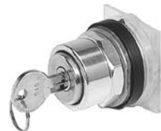
Key Operated Push Button 9001KR

For use in hazardous locations, see page 23. Key operated push buttons are used wherever unauthorized use of a push button is discouraged. Examples are locking a Start push button in the extended position or locking a Stop push button in the depressed position. The operator can also be locked in the flush position—holding all contacts open. Up to two 9001KA contact blocks can be mounted in tandem (total of four blocks). Legend Plate and Contact Block Not Included (“x” = locked position).