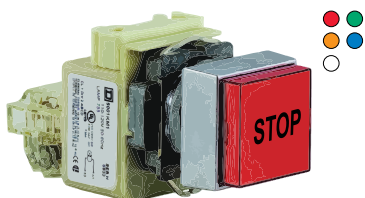
Illuminated single push button with contacts 9001KXRB1RH1 See page 70