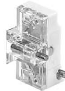
Push-on Push-off Module 9001K85

This module can be added to standard 9001K, 9001KX, 9001SK or 9001T momentary push button operators. Contact blocks mounted behind this module (maximum of 2) are held in the depressed position when the operator is pressed once, and released to their normal position when the operator is pressed again. For a N.C. circuit, use a 9001KA3 or the N.C. contact of either a 9001KA1 or 9001KA4. For a N.O. circuit, use the N.O. contact of either a 9001KA4 or 9001KA6.