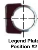
Legend Plate Position #2