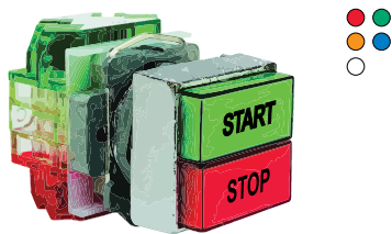
Non-illuminated dual push button with contacts 9001KXRC136 See page 70