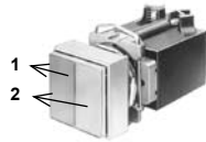
110–120 V, 50–60 Hz. Transformer