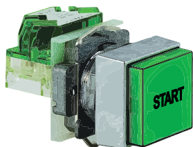
Non-illuminated single push button with contacts 9001KXRA133 See page 70