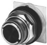
Selector Push Button 9001KQ

For use in hazardous locations, see page 23. Legend plate and contact block not included. Inserts are field convertible. For colors not listed, order operator without insert, plus separate color insert from page 28. Up to two 9001KA contact blocks can be mounted in tandem (total of four blocks). Selector push buttons cannot be illuminated.