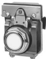
Time Delay Push Button 9001KRD