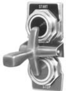
Rocker Arm Operating Lever 9001K50