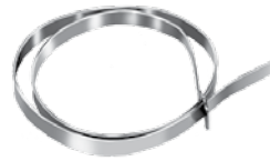
Standard Band Tool Part Number 600-058 1.18 lbs. / 6.75 Inches (172mm.) Length