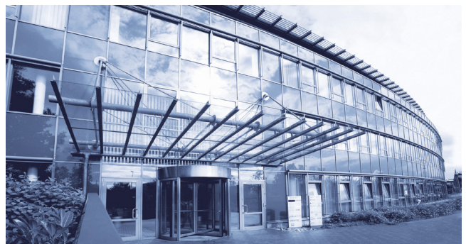
Basler AG Germany, Headquarters

Basler has three decades of experience in computer vision. The company is home to approximately 600 employees, at its headquarters in Ahrensburg, Germany, and at its subsidiaries and sales offices in Europe, Asia, and North America.