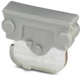
Feed-through connector, Length: 10.5 mm, Width: 4 mm, Color: gray

Please be informed that the data shown in this PDF Document is generated from our Online Catalog. Please find the complete data in the user's documentation. Our General Terms of Use for Downloads are valid ( http://phoenixcontact.com/download )